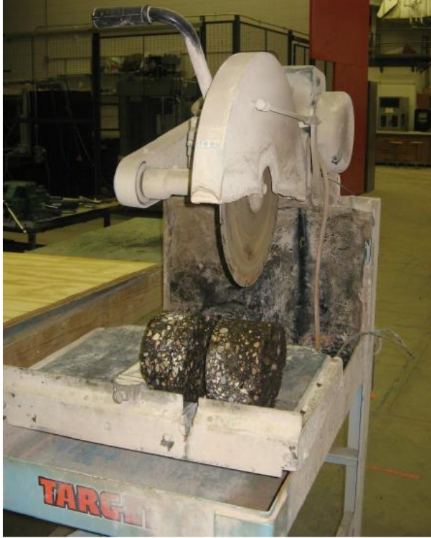
Figure 2: The concrete saw used in sizing the specimens to APA height requirements.