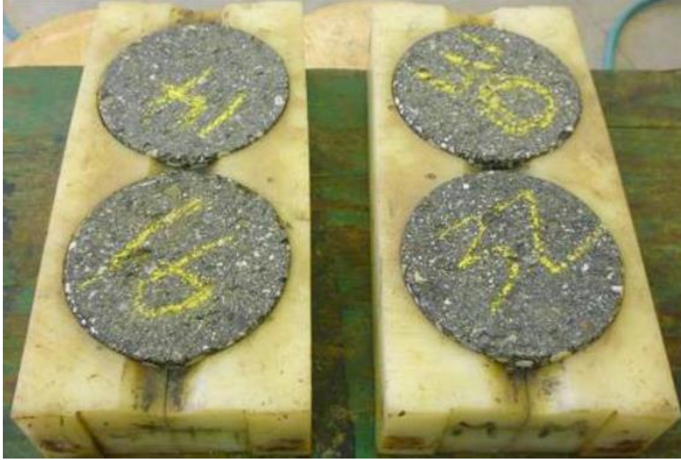
Figure 3: Placing specimens in the molds for running in APA