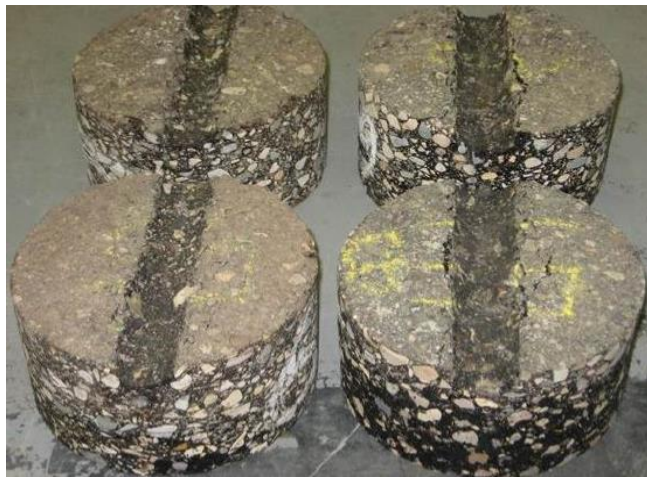
Figure 4: Rut depth by using APA: HMA, left, and WMA on the right

The utilization of the APA has been cost-effective, fast and practical to use. Evaluation of mix asphalt performance with respect to rutting was carried out using APA according to AASHTO TP 63-03, the standard method of test for determining rutting susceptibility of Asphalt paving mixture using APA. A 3/8 inch (9.0 mm) rutting depth was considered the criterion for failure. Figure 4 shows the rut results on four specimens after 8,000 APA loading cycles. In this figure, the two specimens on the left were HMA, and the two on the right are WMA specimens.